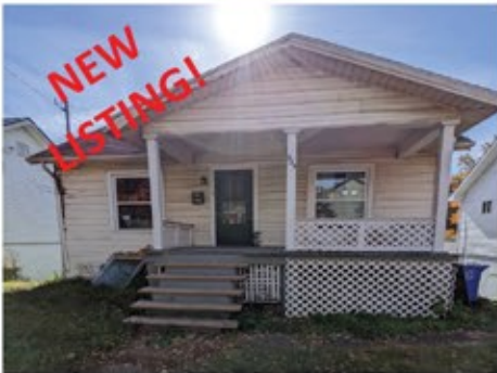
3 Bed 1.5 Bath Mt. Gilead $123,700

740-501-0620 | Monday-Friday 8-6, Saturday 8-4 18720 Butler Rd, Fredericktown, OH