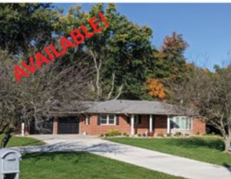
3 Bed 1.5 Bath, Brick Ranch Galion $239,700