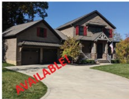
3 Bed 2 Bath, Candlewood Lake Front w/Dock $749,700