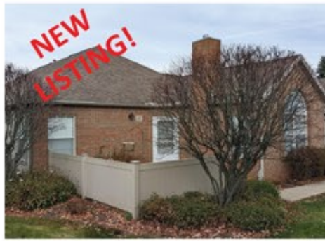
2 Bed 2 Bath Crossings at Forest Glen Condo in Mansfield $179,700