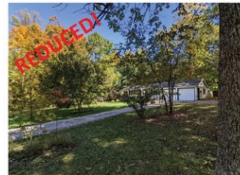
3 Bed 1 Bath Fredericktown $204,900

*3 MLS Services * All Major RE Websites * Social Media Marketing