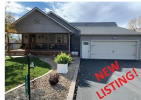
2 Bed 2 Bath at Candlewood Lake $329,700