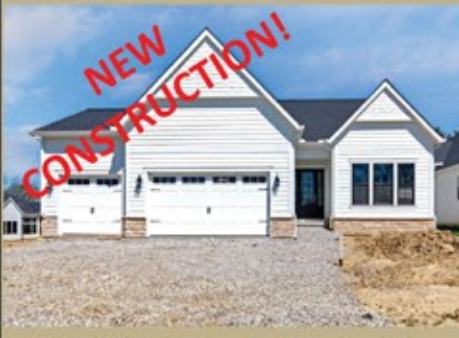
4 Bed 3 Bath Condo Westerville $889,700