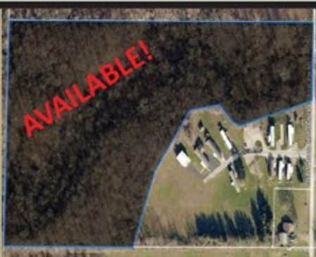
15+ Acres Wooded w/Stream Galion $99,900