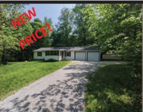
3 Bed 2 Bath Fredericktown $176,800