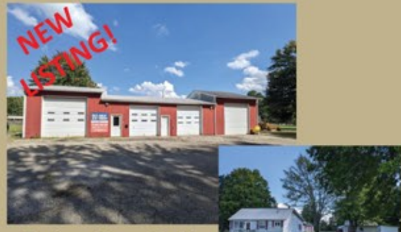
Business Opportunity w/1 Bed Home 3+ Acres Cardington $395,700