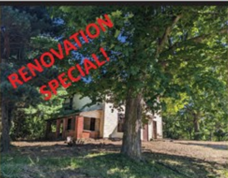
4 Bed 2 Bath 3+ Acres Marengo $127,700