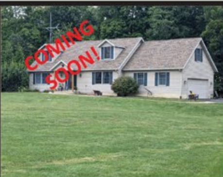
4 Bed 2.5 Bath 6+ Acres Mt. Gilead $487,700