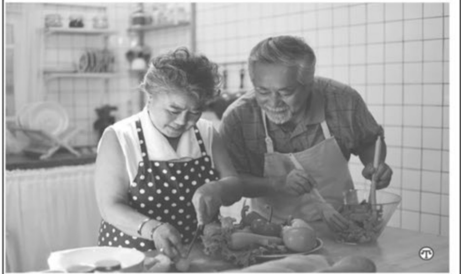
More fruits and vegetables and fewer sugary snacks in your diet can help you combat diabetes.