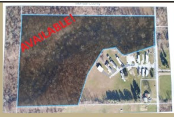
15 Wooded Acres in Crawford County! $100,700