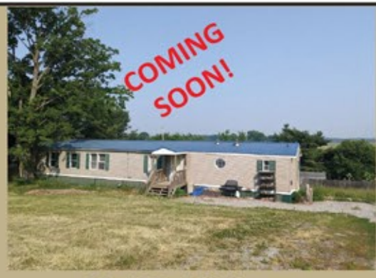
3 Bed 2 Bath Mt. Vernon $69,700