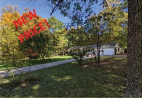
3 Bed 1 Bath Fredericktown $189,999