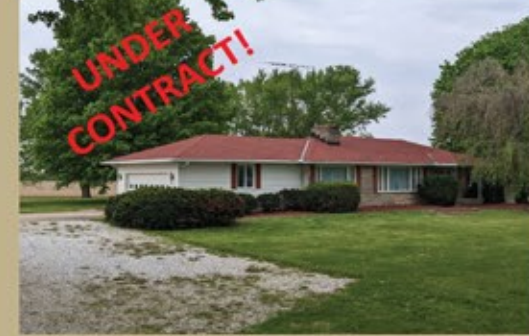
3 Bed 1 Bath, 2+ acres Galion $289,700

40 years of experience with Central Ohio families, farmers and businesses! Give us a call for a free, no obligation market value analysis and 7 day program overview. We will help make your dreams come true!