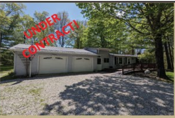
3 Bed 2 Bath, 13+ acres Mt. Gilead $309,700

740-501-0620 | Monday-Friday 8-6, Saturday 8-4 18720 Butler Rd, Fredericktown, OH