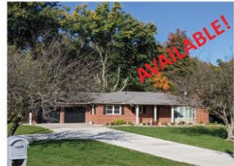
3 Bed 1.5 Bath, Brick Ranch Galion $239,700