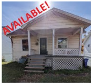
3 Bed 1.5 Bath Mt. Gilead $123,700