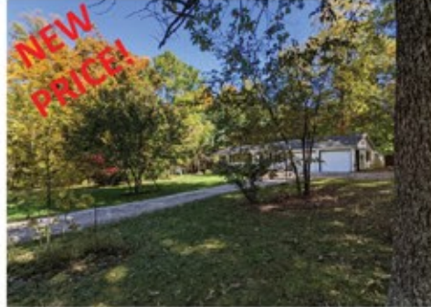
3 Bed 1 Bath Fredericktown $199,999