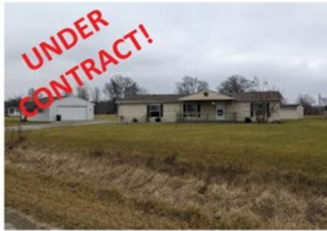
3 Bed 2 Bath, 1.3 ac. in Cardington $199,700