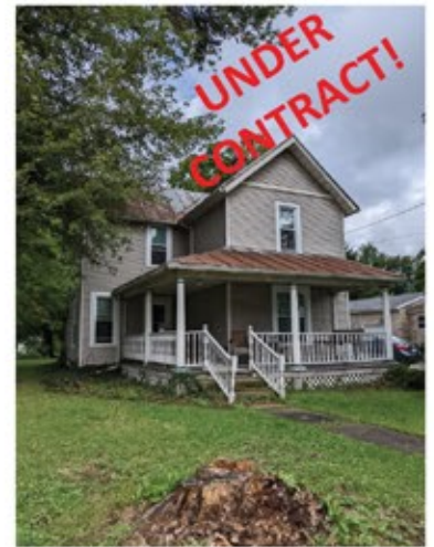
4 Bed 2 Bath in Mt. Gilead $142,700

* 3 MLS Services * All Major RE Websites * Social Media Marketing